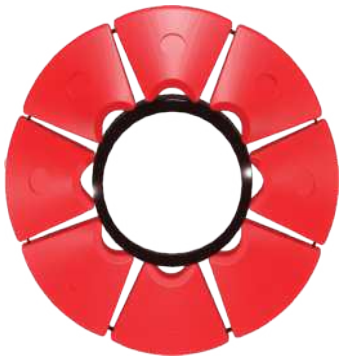
18 inch pipe 8 float units