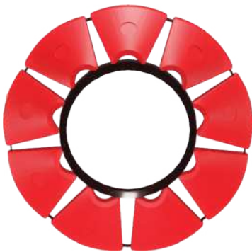
24 inch pipe 9 float units